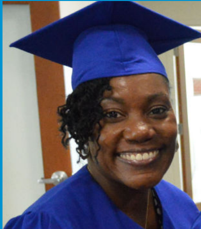
Antina 2019 Goodwill Healthcare Training Program Graduate

Today marks a day that we've all worked so hard to see. For 13 weeks, we have studied, stressed and strived to make it to this day, and it is finally here. Our hard work and perseverance paid off. Due to the dedication of the Goodwill team, we know that our future is now forever changed for the better."